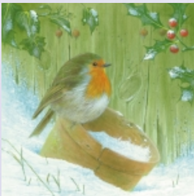
5 – ROBIN ON A FLOWERPOT 'Season's Greetings' Pack of 10 cards £3.75 Size: 150 x 150mm