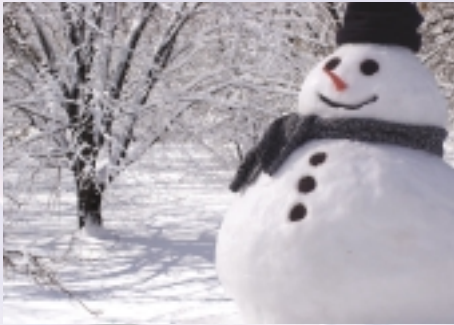
1 – SNOWMAN 'Season's Greetings' Pack of 10 cards £3.50 Size: 171 x 121mm