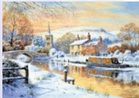
6 – CANALSIDE CHRISTMAS 'Season's Greetings' Pack of 10 cards £3.50 Size: 171 x 121mm