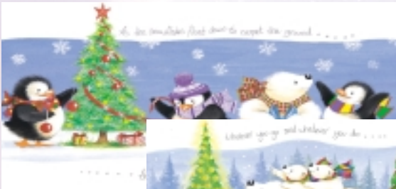
3 – THE MAGIC OF CHRISTMAS & CHRISTMAS WISHES 'Season's Greetings' Pack of 10 cards (Twin Pack) £2.95 Size: 85 x 180mm