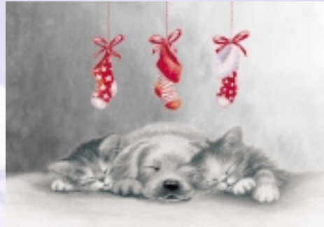
2 – CHRISTMAS EVE 'Season's Greetings' Pack of 10 cards £3.50 Size: 171 x 121mm